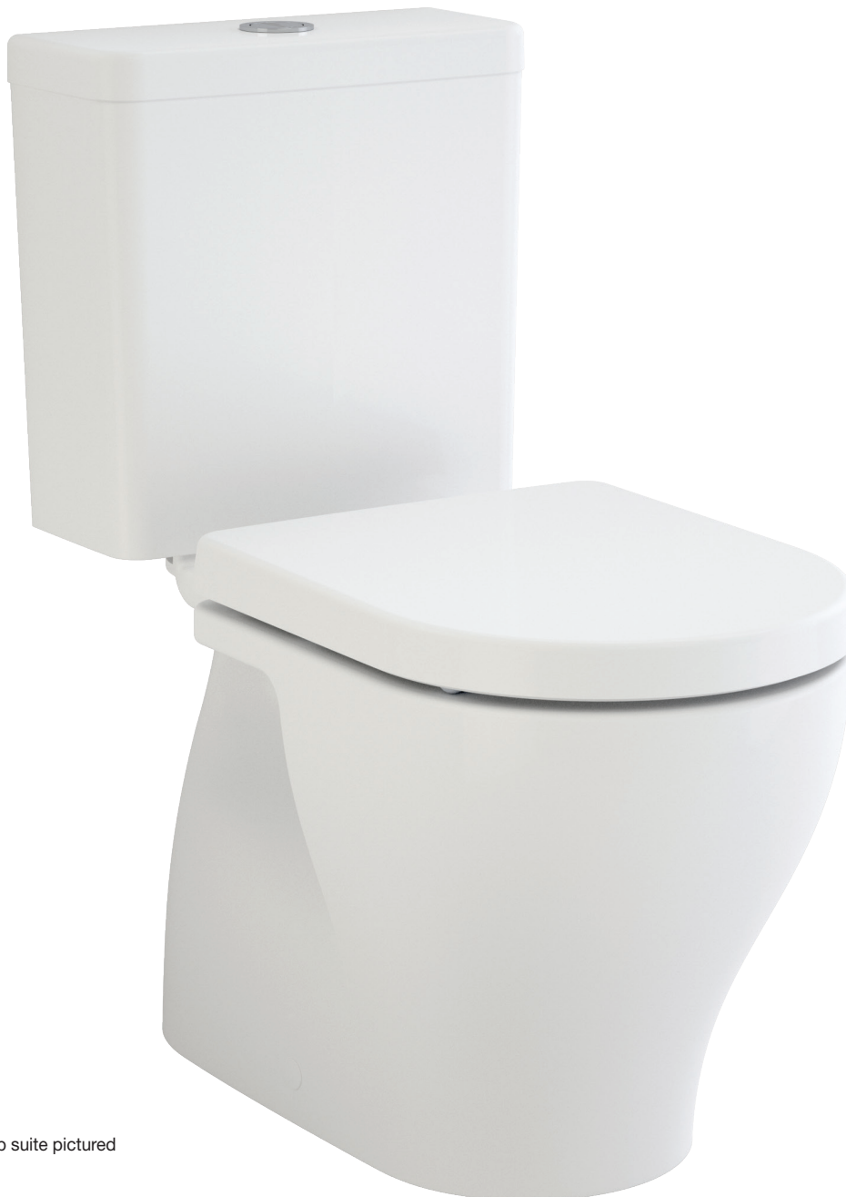
S trap suite pictured

Designed with the patented Orbital® 50mm Variable Offset Connector