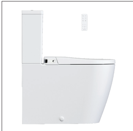
Back entry version of pan pictured

Our Urbane II bidets have a contemporary minimalistic design to match the rest of the Urbane II bathroom collection. Enjoy the ultimate flexibility of our innovative bidet seat, featuring gender specific washes, drying options and a self cleaning nozzle. Experience handy features that elevate your experience, including auto open & auto close seat, LED nightlight & ambient lighting, heated seat and a remote for full control.