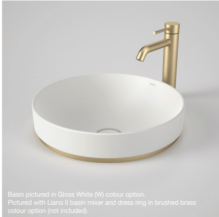
Basin pictured in Gloss White (W) colour option. Pictured with Liano II basin mixer and dress ring in brushed brass colour option (not included).

The Liano II Basin range is a collection of fashionable basins that allow you to select a style and colour finish to suit your own personal taste, but also delivers to your functional needs. Available in popular round and pill shapes with contemporary thin rim design and in a range of matte colour finishes, the Liano II basin range is the collection you need to make a statement in your bathroom. Optional pop-up plug & wastes and new dress rings are available in Chrome, Matte Black, PVD Brushed Nickel, PVD Brushed Brass and PVD Gunmetal to match with Liano II tapware. The basin is suitable for general purpose, domestic and commercial applications.