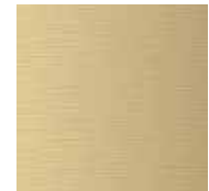
Brushed Brass SR232BB