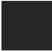
Matte Black SR232B