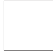
Matte White SR232MW