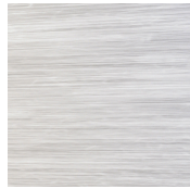
Brushed Nickel SR232NK