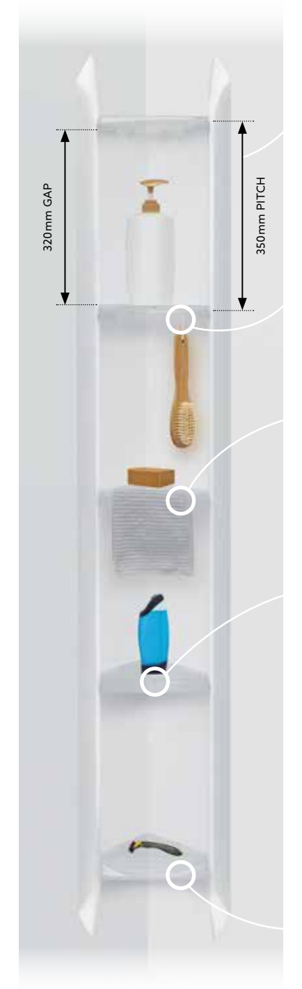
*2040/1935mm FIVE SHELF ONLY