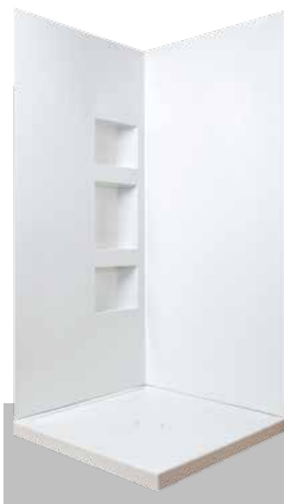
Top View (Generic - 2 sided)