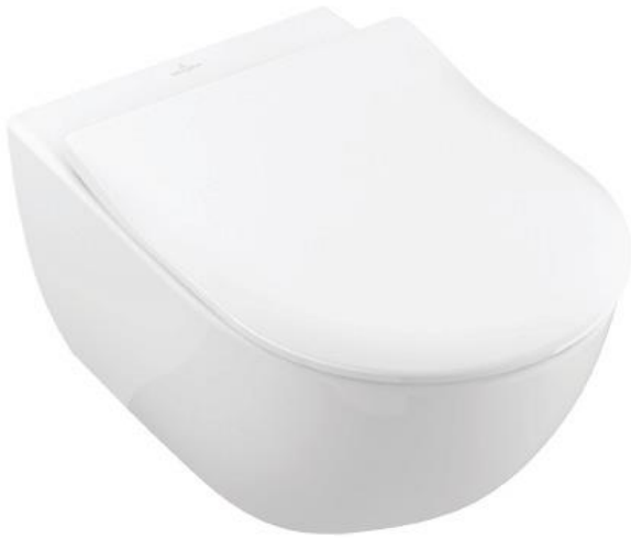
Optional: Slim Seat